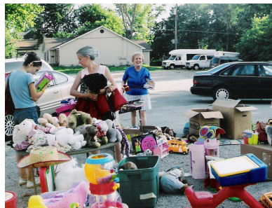
WE Volunteers work at the Liberty rummage sale organizing donations while shoppers browse.